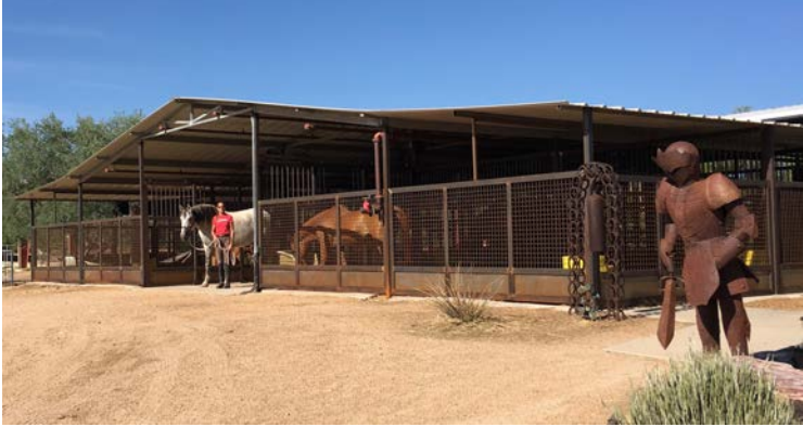
Front view of the newly renovated eight stall Camelot barn. keep water cool in the summer and prevent freezing of pipes during our brief winter cold spells. As with every aspect of this ranch, our students' independent use was at the forefront of our design and construction plan and the results are incredible.

Over the last four months we have been painstakingly renovating the barn, a project that has been in the works for well over a year has finally come to fruition. The extraordinary new structure before me always takes my breath away - she is beautiful, she is strong, and most importantly, she is completely accessible and ADA compliant. Innovative design features enable students to independently feed each horse and gain access to each and every stall. Made of welded steel "mesh", our new barn features full ventilation, window wheelchair accessibility for feeding grain and hay, sliding gates and automatic waterers designed to